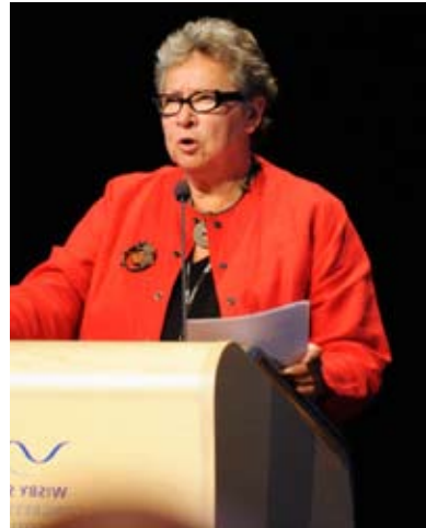
Sinikka Boblin, Member of the Swedish Riksdag, Chair of BSPC Standing Committee 2007–2008.