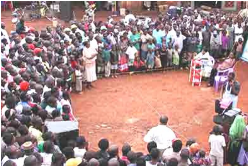
The performance attracts many people