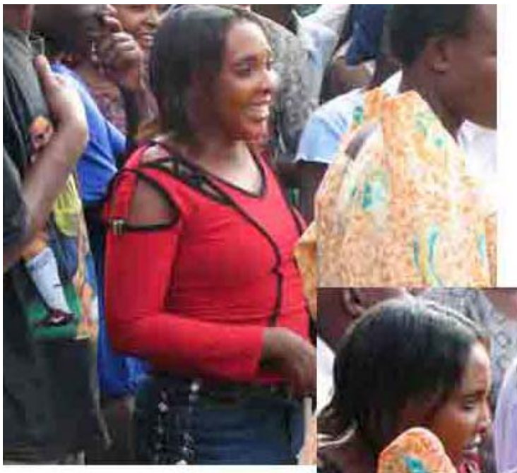
Young girl bleached by mercury soap. Initially she is having fun over the performance until the message of the health hazards dawns upon her.

Derudover gennemførtes en awareness kampagne for skolebørn i puberteten, som undervisning, rollespil og små teaterstykker til oplysning for de unge. Det er specielt vigtigt at få de unge piger til at indse at deres sorte farve er flot og at brug af kviksølvholdige sæber kan give store problemer for dem selv og deres kommende børn. For de unge mænd er det vigtigt at få dem til at indse at sorte piger er attraktive.