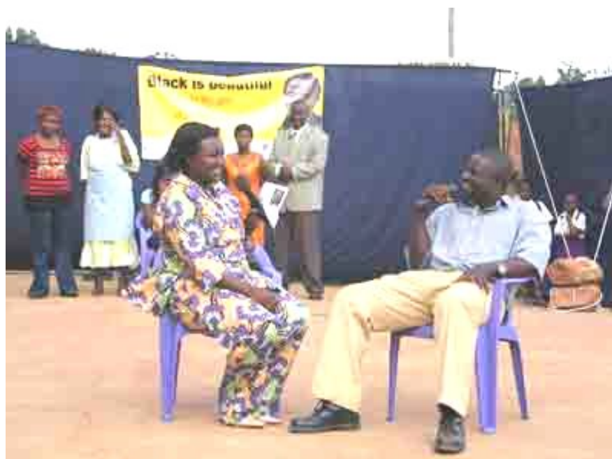
The more bold spectators go on stage and present their views