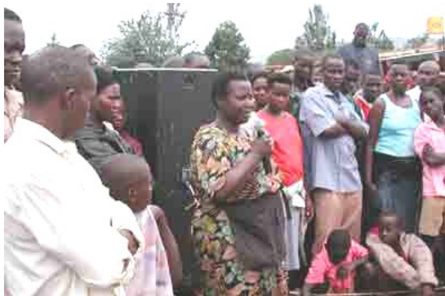
The audience gives their contribution to solve the problems