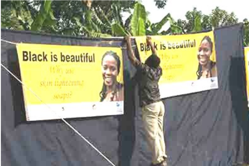
Posters as background on the scene of performance

The project was jointly financed by Nordic Council of Ministers (NCM), Geological Survey of Denmark and Greenland (GEUS) and Mellempfolkeligt Samvirke Uganda (MS Uganda).