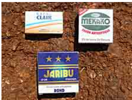
Bleaching soaps containing mercury

After the successful campaign in Uganda, The Danish Embassy in Tanzania has decided to support a similar campaign in Tanzania. This will take place in 2008.