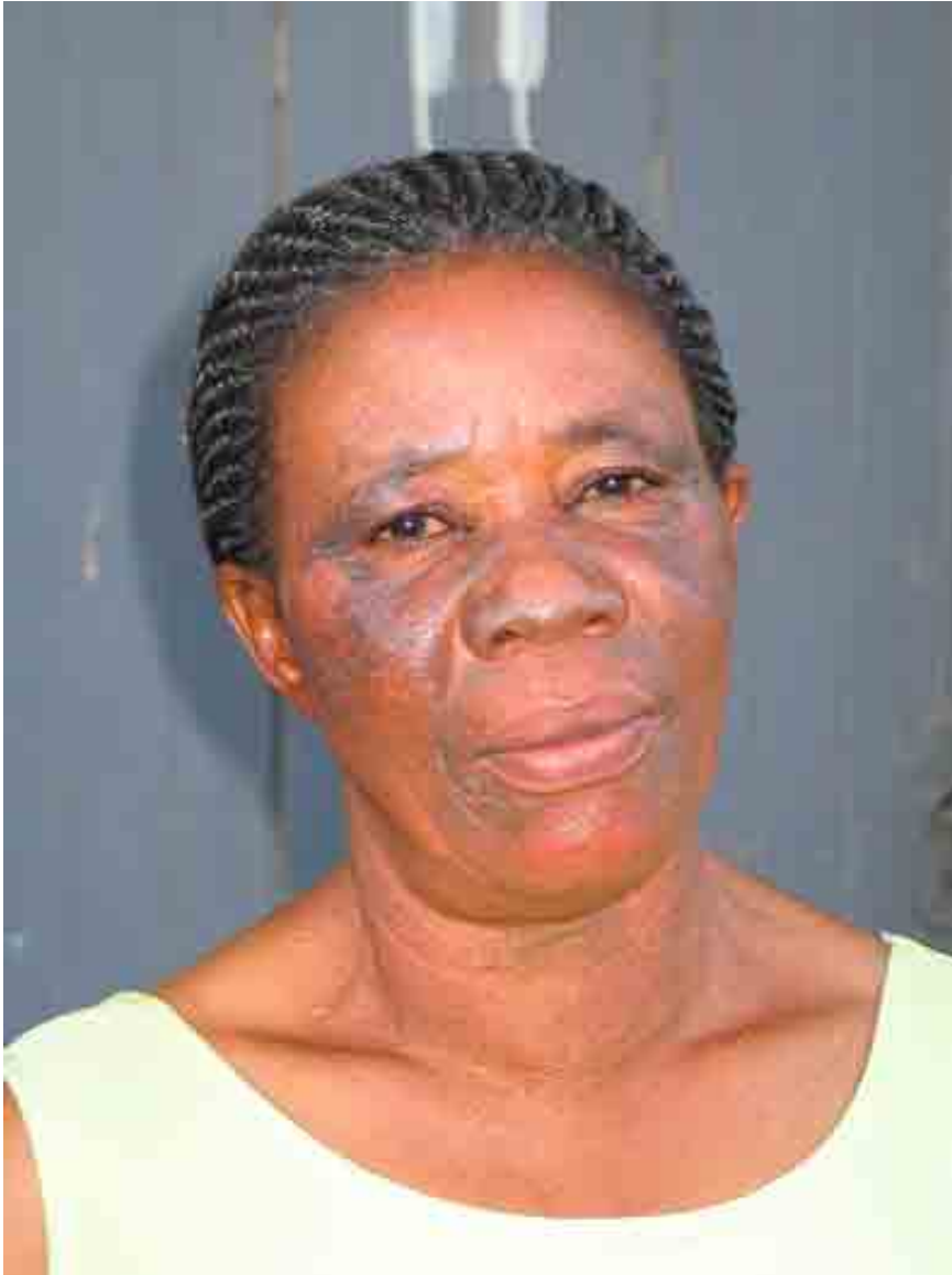
Skin problems caused by bleaching with mercury soaps

den and Iceland attended. The Norwegian ambassador was unable to come, but sent another representative instead.